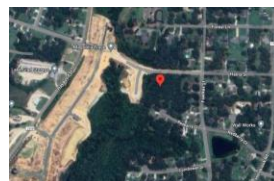
Harris St in Wendell - Aug 23 rd to Nov 1st