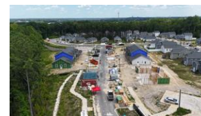
Old Poole Place in Raleigh - Sept 9 th to Dec 20 th