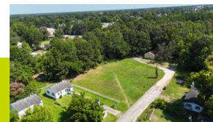
Rand St in Smithfield - Oct 18 th to Dec 20th