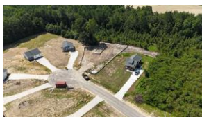
Stone Creek in Clayton - Aug 23 rd to Oct 11 th

During the 2025 Fall Beloved Build Campaign we will be building in five neighborhoods.