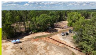
A new neighborhood in Garner - Oct 11 th to Dec 20th