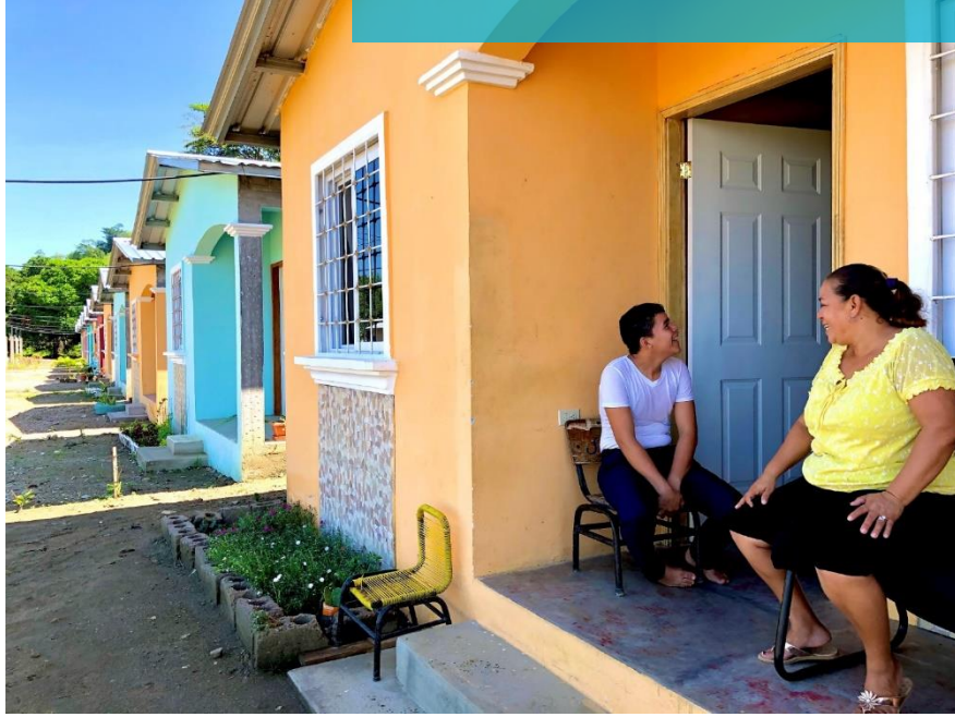
San Rafael, La Ceiba