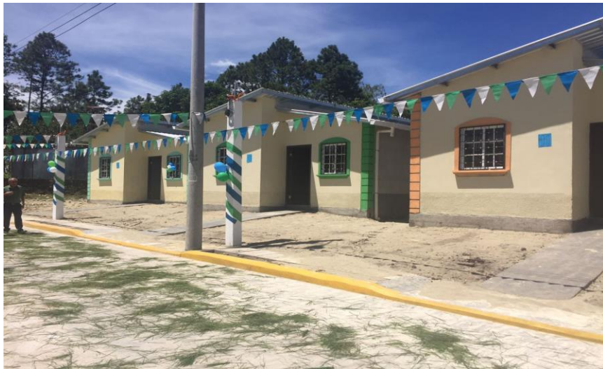
Llanos de Santa Rosa, Santa Rosa de Copán: 19 houses