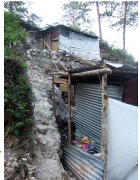
Some typical single-family homes in Santa Rosa ▶