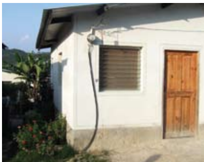
◀ A Habitat Honduras home