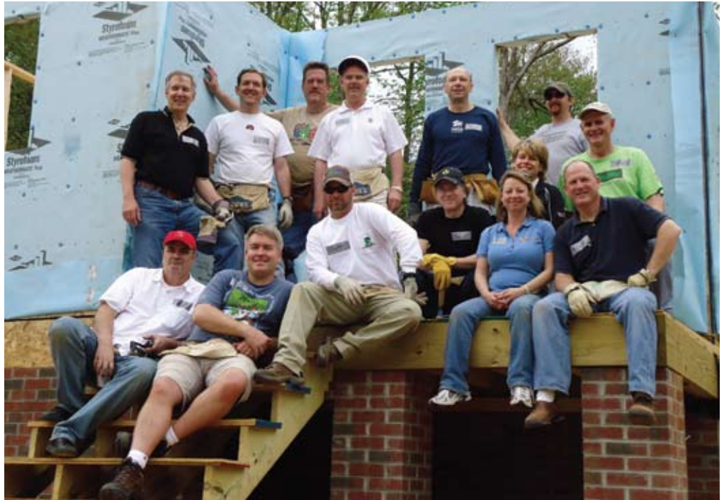
CEO Build executives and Habitat staff on the build site ▲