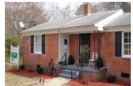
▶ Rebecca's home not only looks more inviting, but it is safer with an added porch rail and more efficient with the replacement of an exterior door.