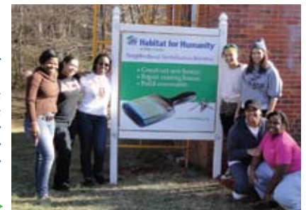
▶ Our first A Brush with Kindness project was enthusiastically supported by community volunteers.