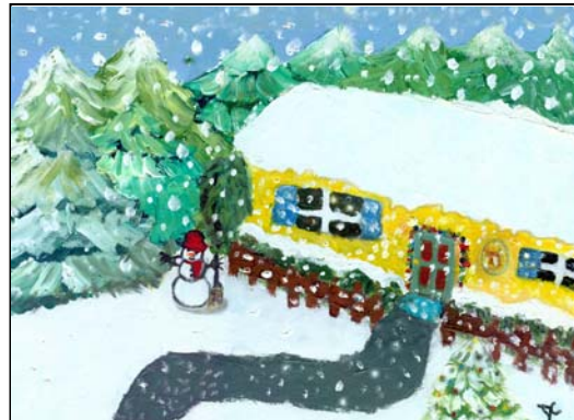
Yellow House artwork

Your gift is an investment in the community. Habitat partners with families to give them a hand-up through home ownership. Volunteers build houses alongside homeowners, and we offer homeowner education so that families can maintain a 20-year, no-interest mortgage. The mortgages families pay and your gifts enable Habitat to continue building.